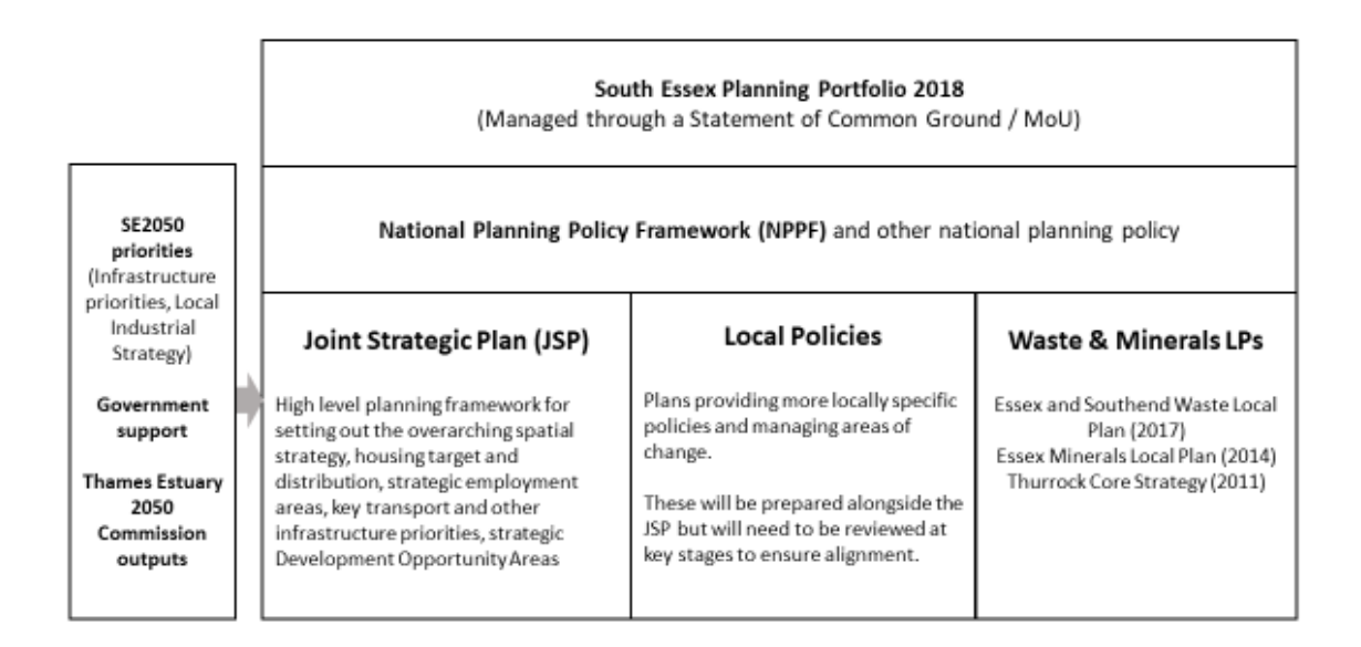
Figure 4: The South Essex Planning Portfolio